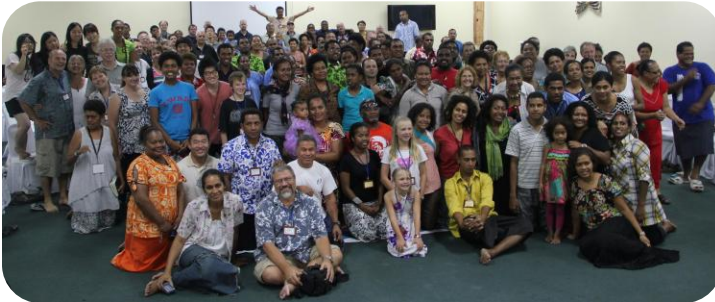
Group photo at the YWAM Pacific Gathering in Suva.